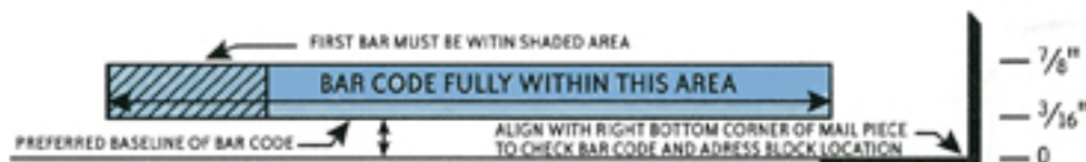
(Bottom Edge of Envelope)

Also available in standard window 1 x 4. Position from left, 1"; from bottom, 3/4"